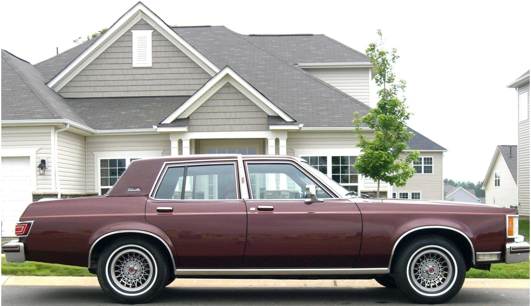
1980 Lincoln Versailles Signature Series in triple Dark Cordovan with Bittersweet pinstripes and interior accents.