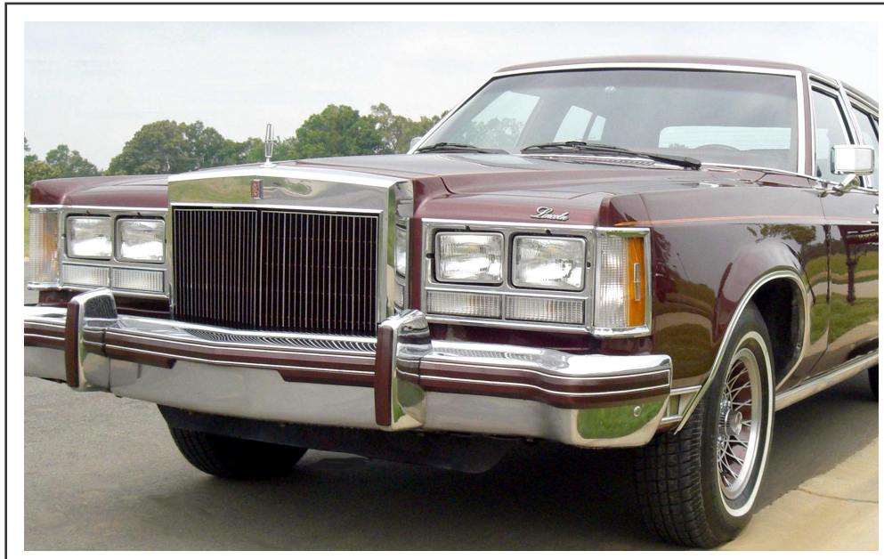
Lincoln Versailles Signature Series for 1980