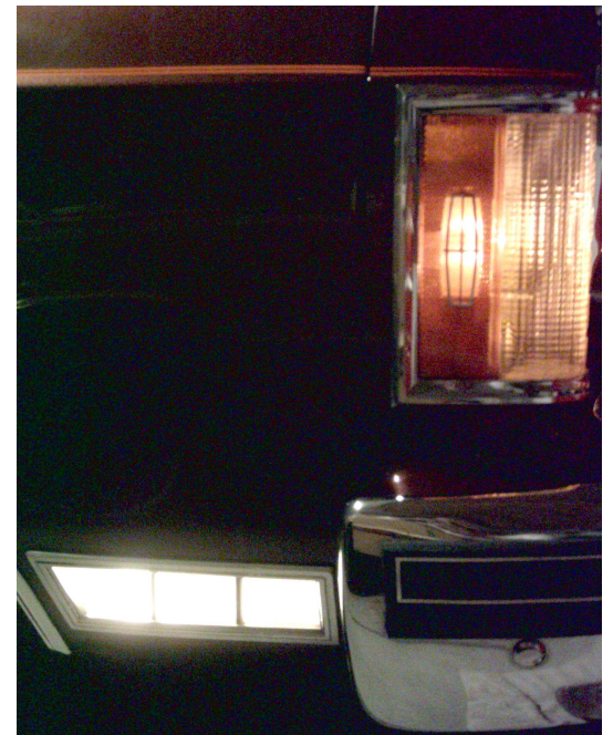
■ Cordovan painted lacy spoke aluminum wheels ■ Carpeted trunk ■ Thermometer mirror ■ Exterior lights: Opera lamps, parking lamps and cornering lamps